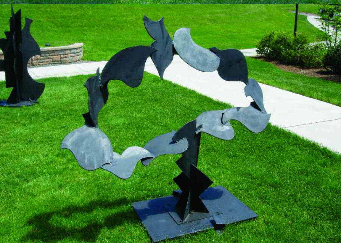
Screen Sculpture #112, 2005. Painted steel, 75 × 82 × 30 inches.