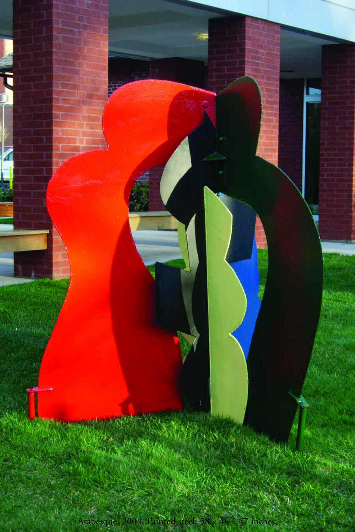
Arabesque, 2004. Painted steel, 58 × 46 × 47 inches.