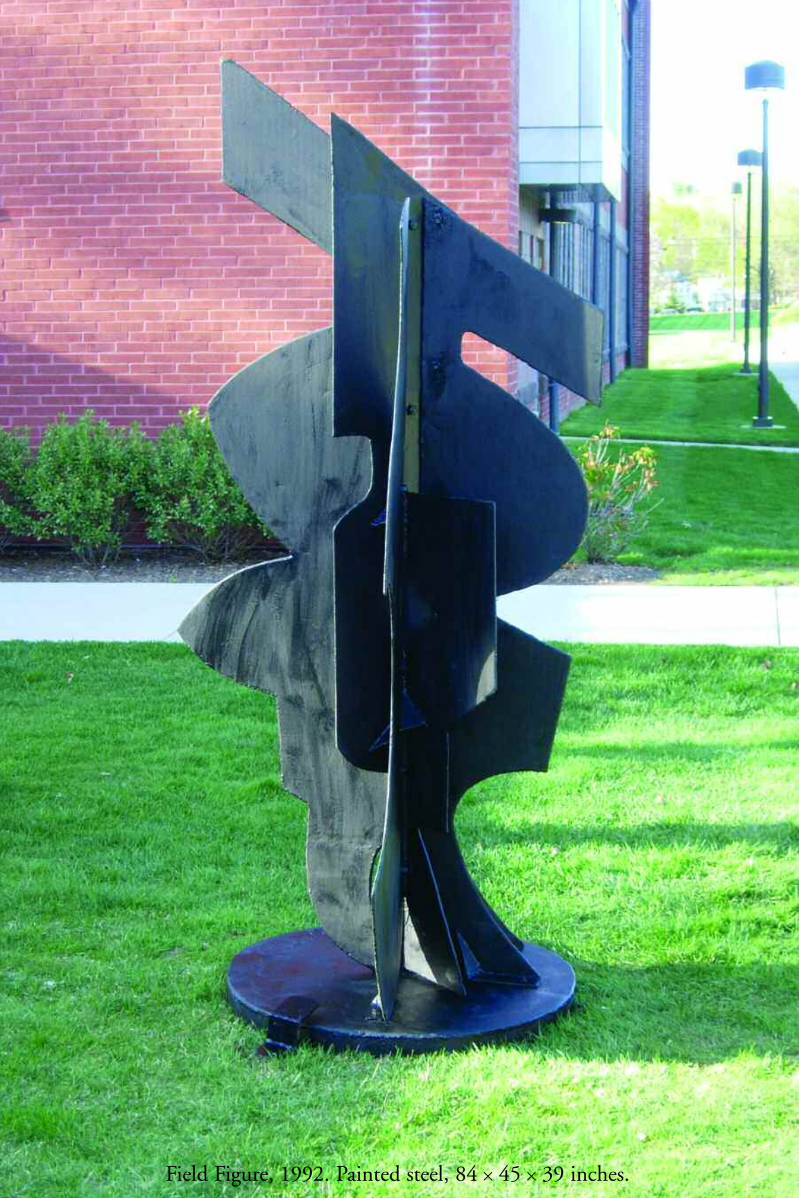
Field Figure, 1992. Painted steel, 84 × 45 × 39 inches.