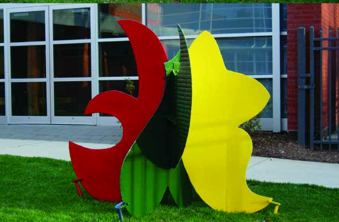
Cockscomb , 2000. Painted steel, 56 × 68 × 55 inches.