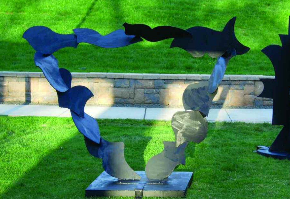
Screen Sculpture #111, 2005. Painted steel, 68 × 94 × 38 inches.