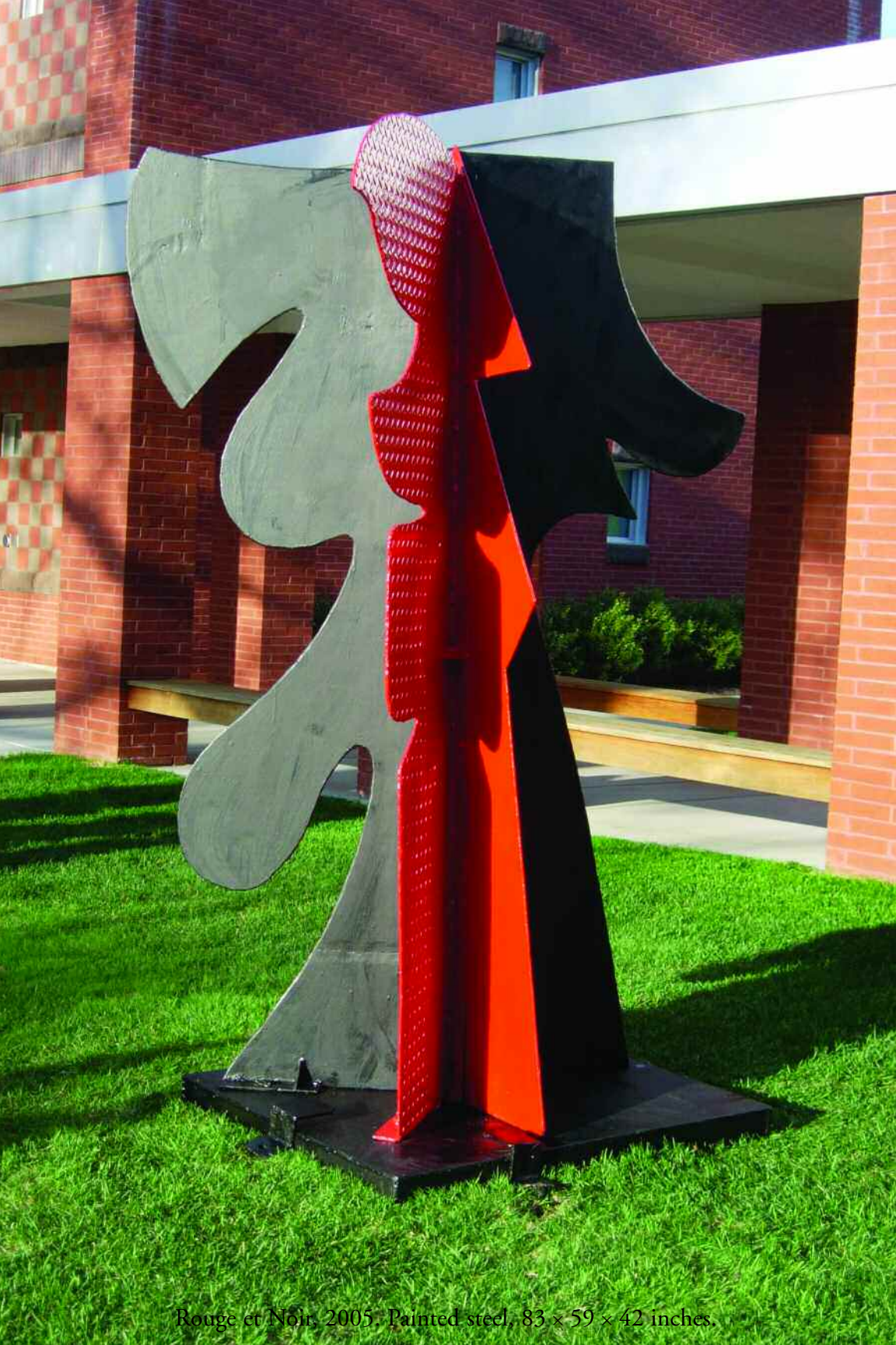
Rouge et Noir, 2005. Painted steel, 83 × 59 × 42 inches.