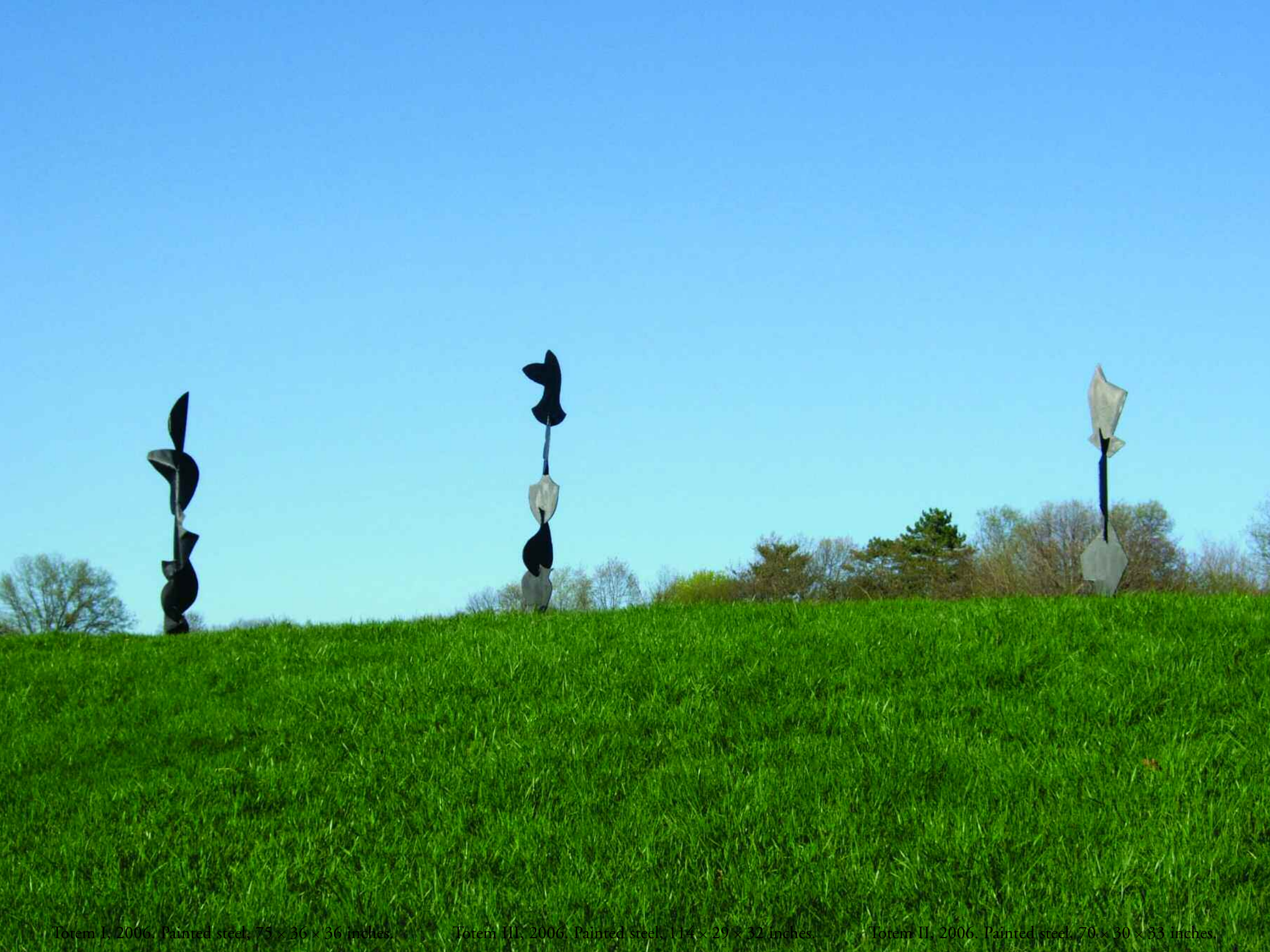
Totem I, 2006. Painted steel, 75 × 36 × 36 inches.