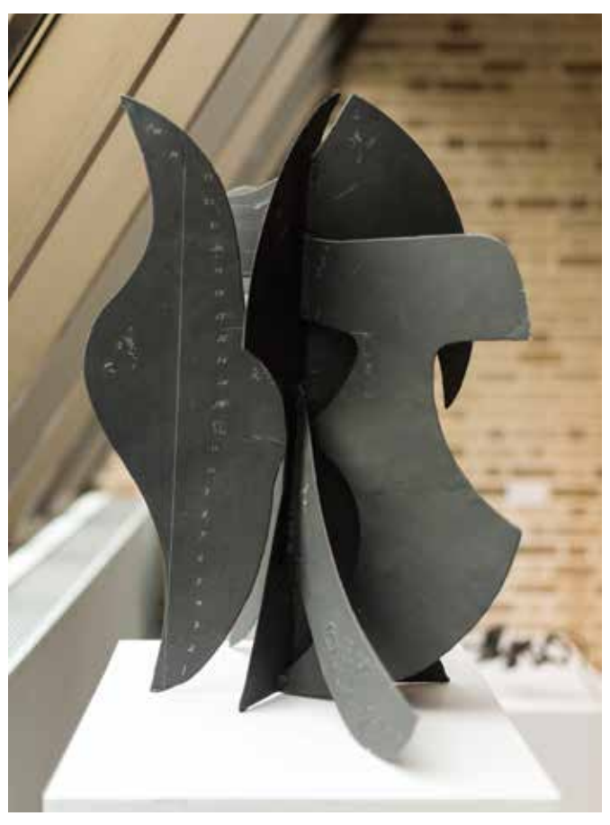
SECOND FLOOR ATRIUM Maquette for Griffon, 1988 painted steel Gift of the artist 1989.036

The Snite Museum of Art is deeply grateful to Sir David Hayes, the artist's son, who made this exhibition possible.