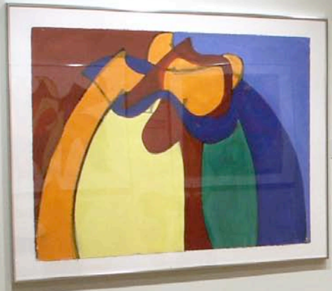
Small white label with text, likely the title and artist of the painting.