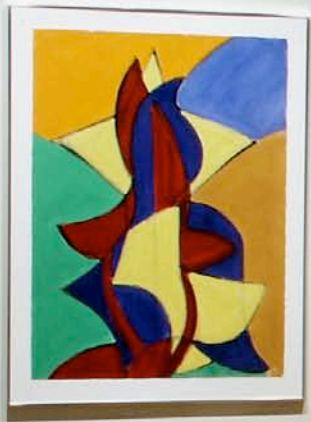
Abstract Painting 1960s