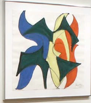
Abstract painting by [unreadable]