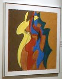
Small white label with text, likely the title and artist of the painting.