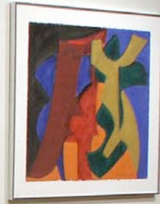
Abstract painting by [unreadable]