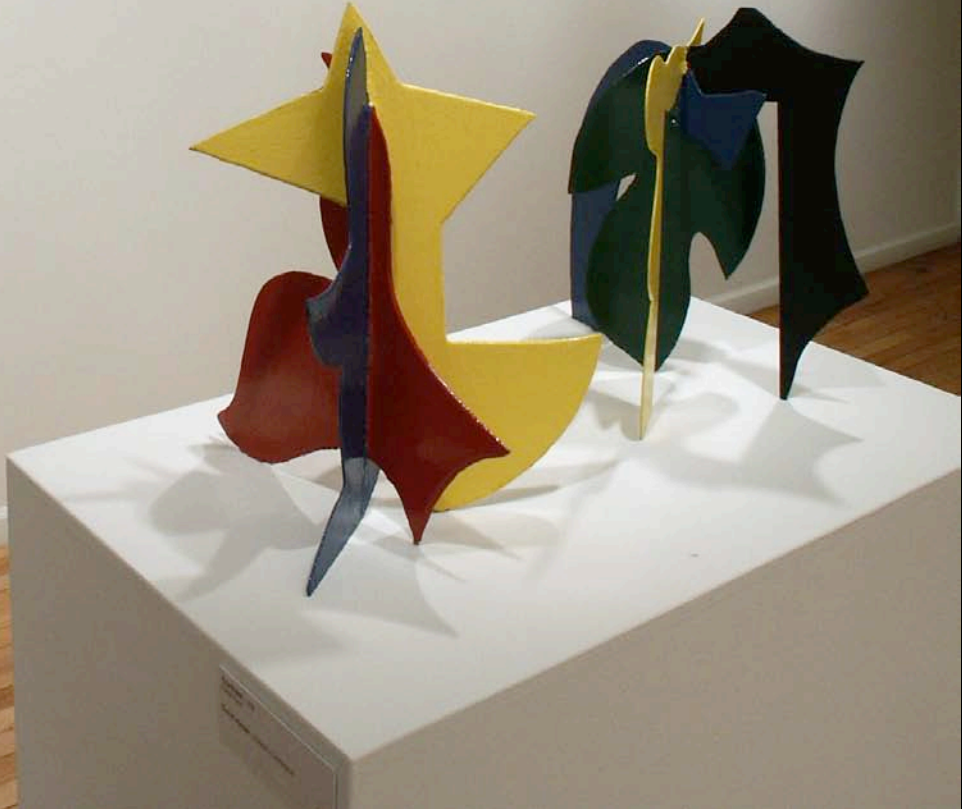
Small white label with text, likely the title and artist of the sculpture.