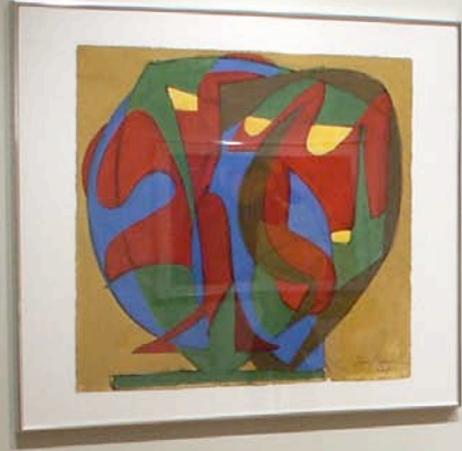
Abstract painting by [unreadable]