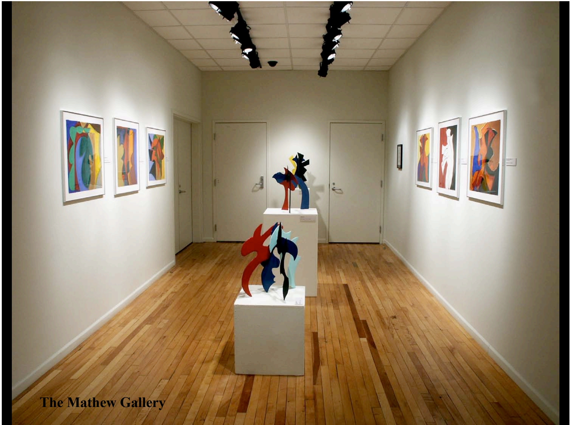
The Mathew Gallery