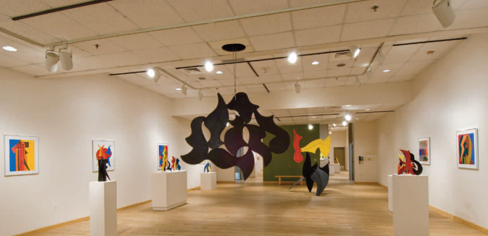
DAVID HAYES: Modern Master of American Abstraction at the Housatonic Museum of Art