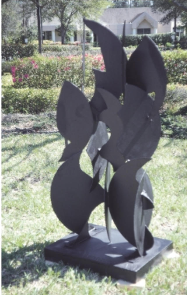
Screen Sculpture #66, 1995, painted steel, 63" x 30" x 20"