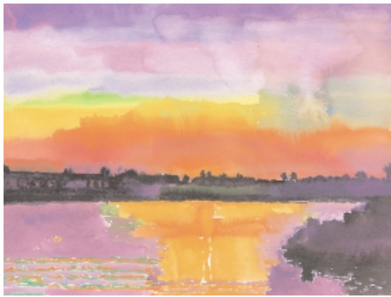
Florida Series – "Naples Sunrise" Watercolor, 2000, 18" x 24"