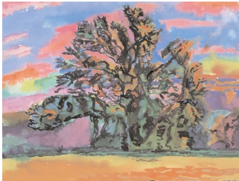
Monumental Tree Series XIX, "Madder Space" Watercolor, 2000, 18" × 24"