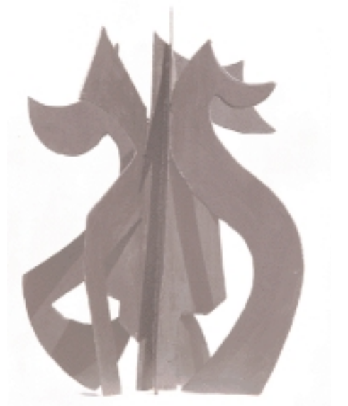
Multipled, 1995 painted steel, 28" x 21" x 22"