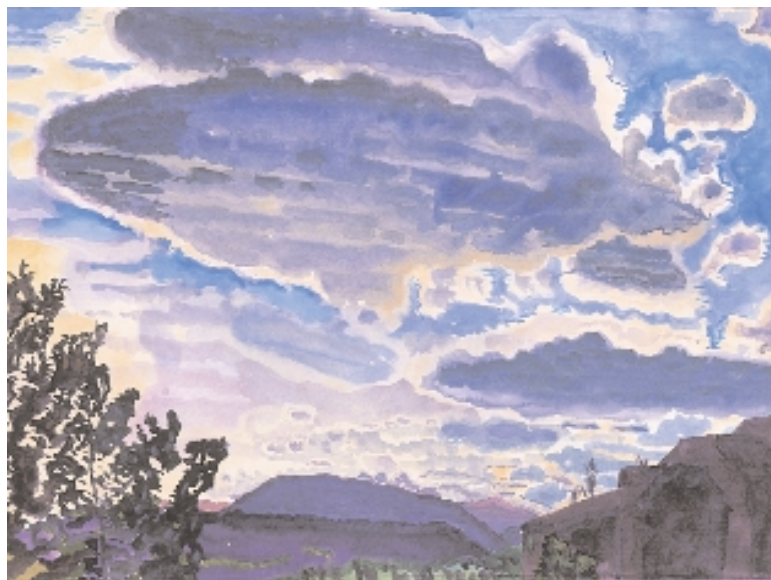
Colorado Series – "Snowmass Dirigible Clouds" Watercolor, 2000, 18" x 24"