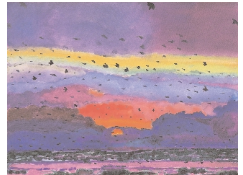
Florida Series, Naples – "Avian Sunset" Watercolor, 2000, 18" x 24"