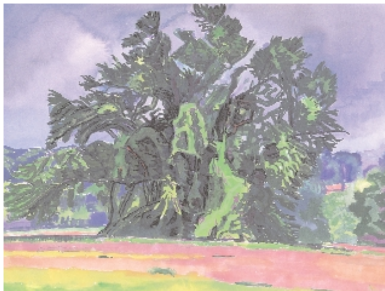
Monumental Tree I, "Serenà's Tree" Watercolor, 1999, 18" × 24"