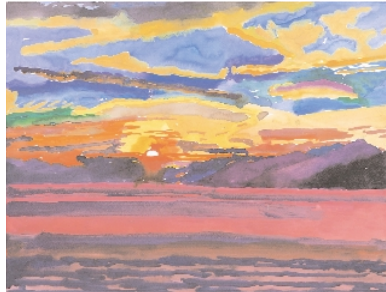
Camogli, Uguia Series – "Camperi Diret" Mountain Sunset, Watercolor, 2000, 18" x 24"