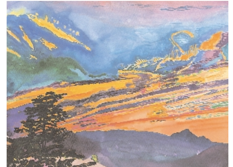
Orvieto Series – "Vertabrae Sky" Watercolor, 2000, 18" x 24"