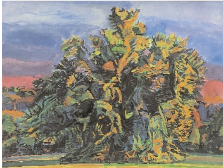
Westbury Monumental Tree, "Danaë" Watercolor, 2000, 22½" × 29½"