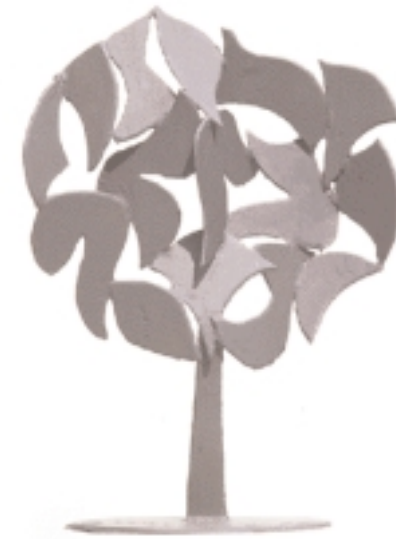
Mounted Screen Sculpture, 1997 painted steel, 23" x 18½" x 8"