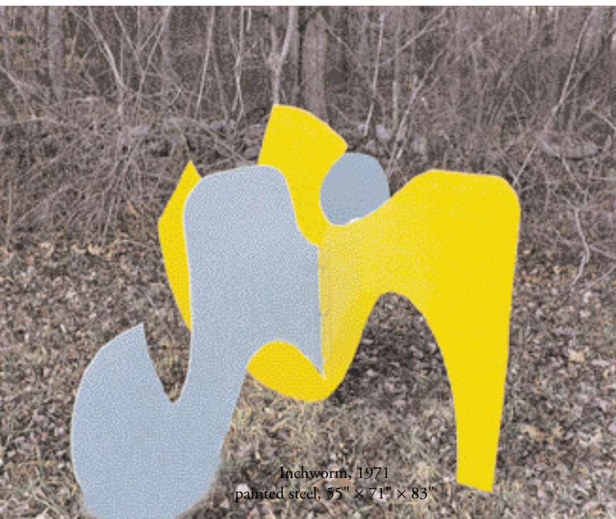
Inchworm, 1971 painted steel, 55" x 71" x 83"