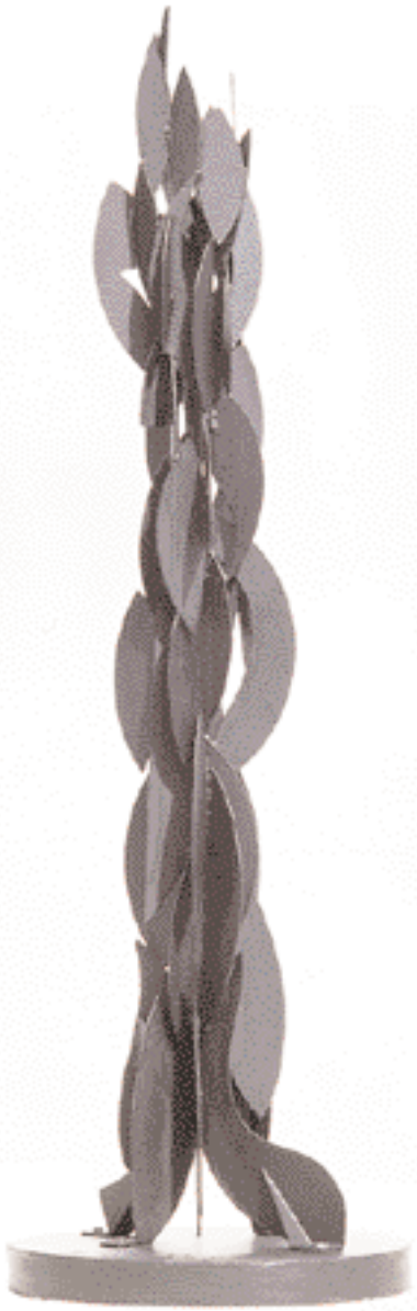
Waterfall, 1998 painted steel, 98" × 30" × 30"