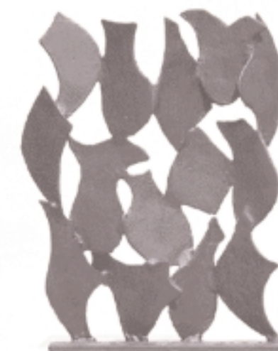
Vertical Screen Sculpture, 1996 painted steel, 15" x 12" x 3½"