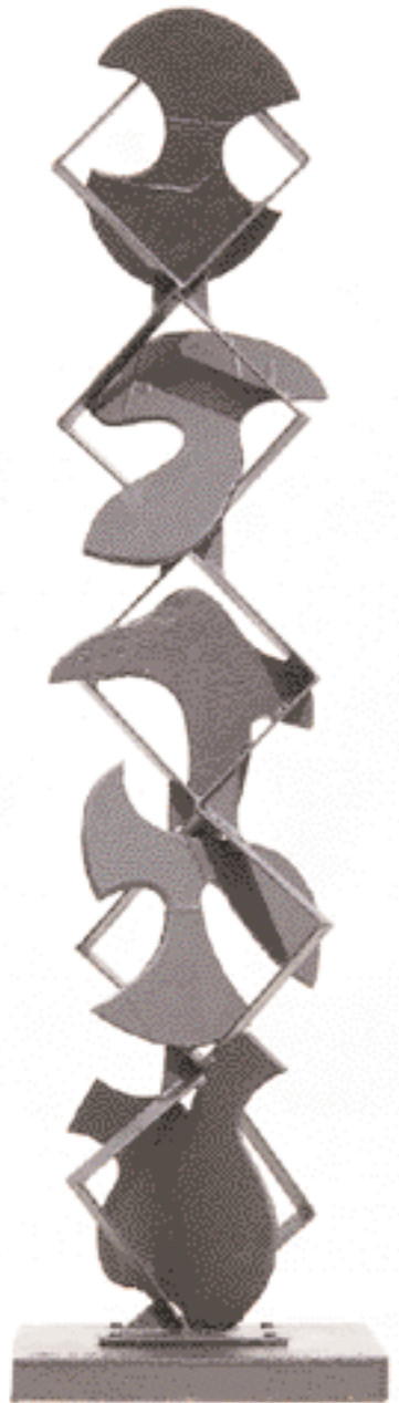
Vertical Diamond #11, 1983 painted steel, 92" × 23½" × 24"