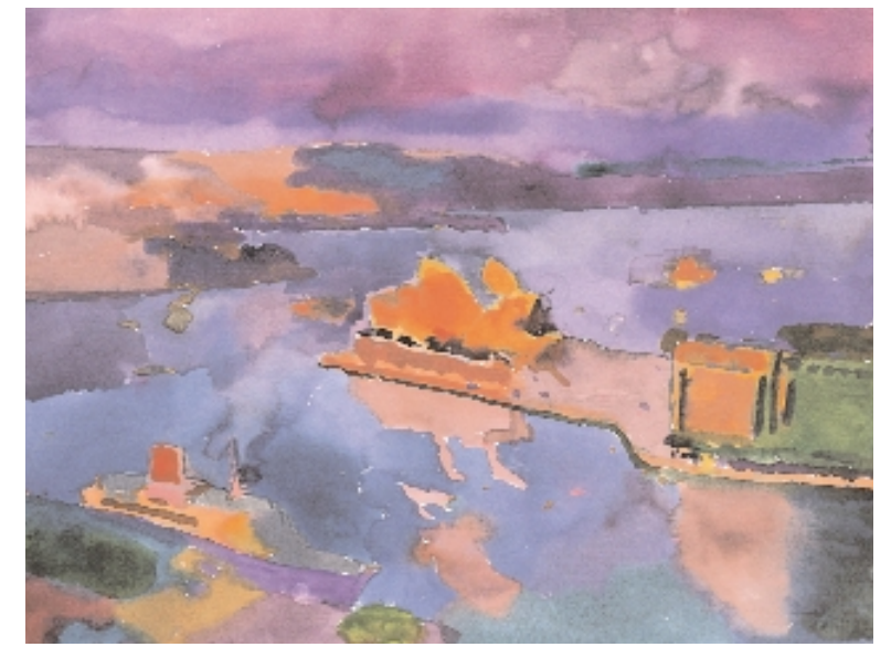
Australia Series, Sydney Opera House – "Sphinx" Series I, Watercolor, 1999, 18" x 24"