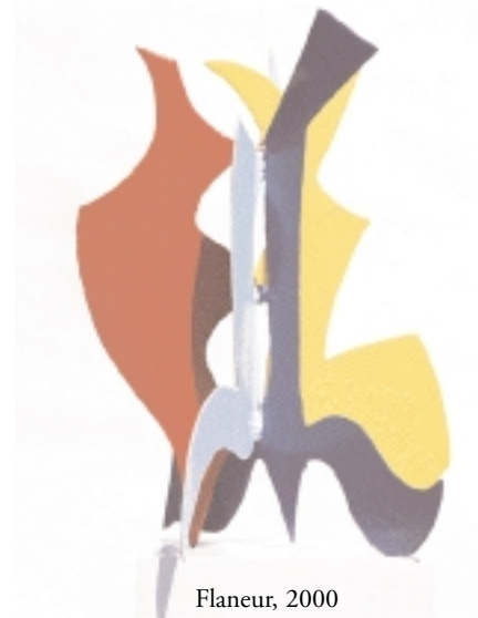
Flaneur, 2000 painted steel, 23" x 21" x 20"