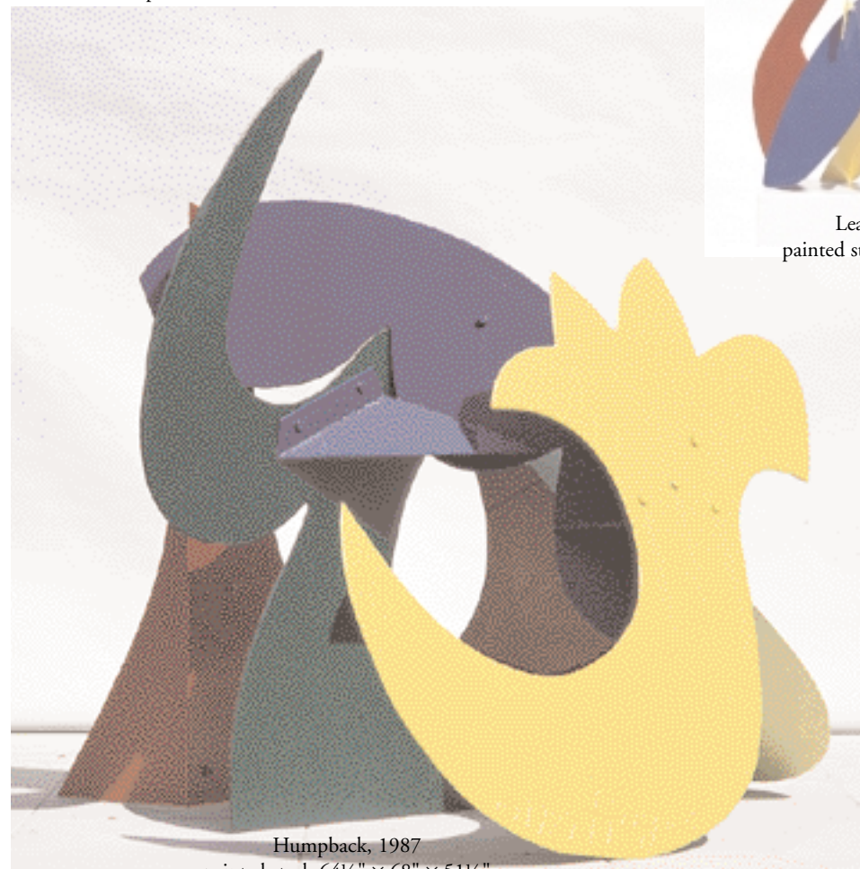
Humpback, 1987 painted steel, 64½" x 68" x 51½"