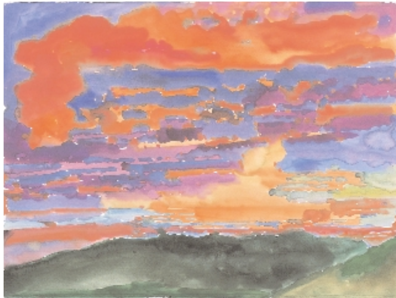
Italy, Umbria – "Red Flash" Watercolor, 2000, 18" x 24"