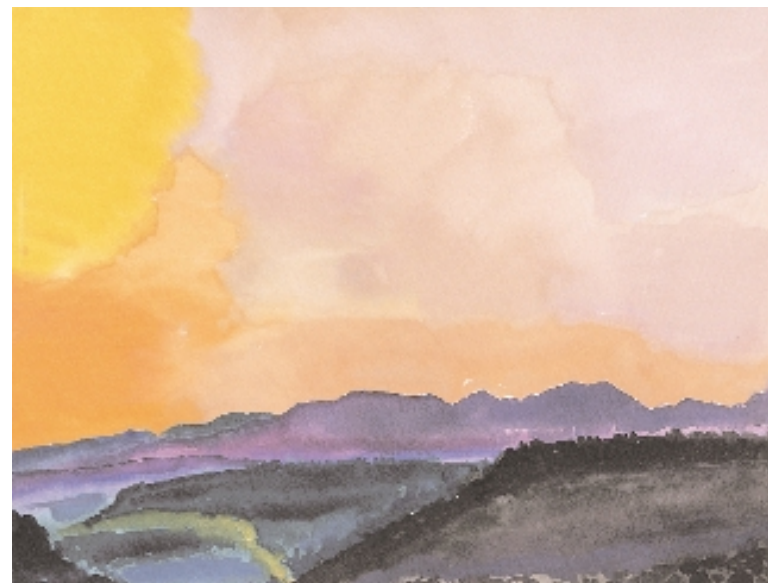
Orvieto Series – "Monastery Vista" Watercolor, 2000, 18" x 24"