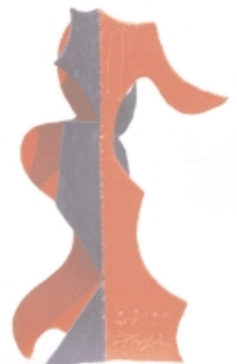
Cavalier, 2000 painted steel, 26" x 12½" x 14"