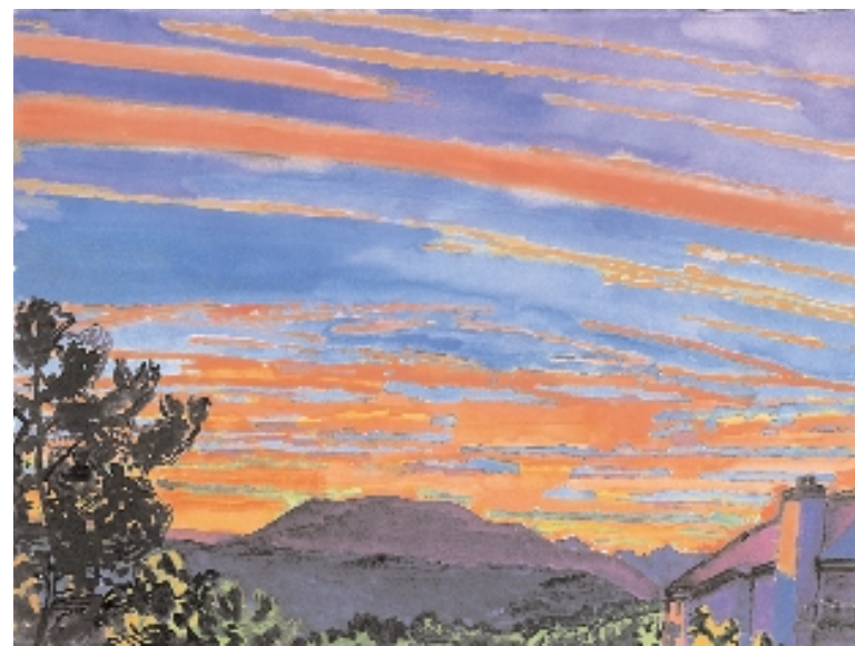
Colorado Series – "Blanket Pink" Watercolor, 2000, 18" x 24"