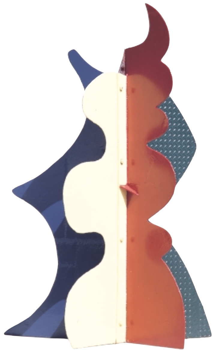
Capricorn, 2000 painted steel, 71" x 38½" x 35½"