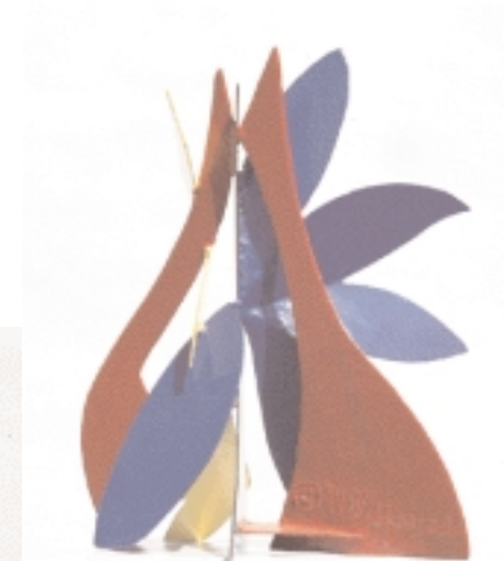
Leaf Figure, 1984 painted steel, 21" x 21" x 19"