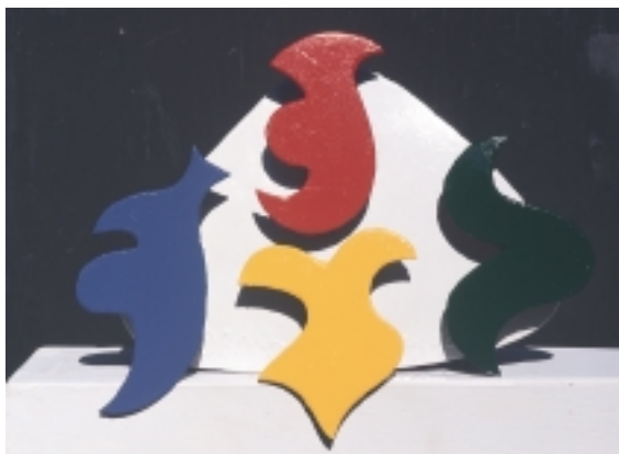
Interrupted Diamond, 2000, painted steel, 25.5" x 32" x 3"