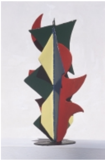
Black Swan, 2000, painted steel, 28" x 35" x 5"