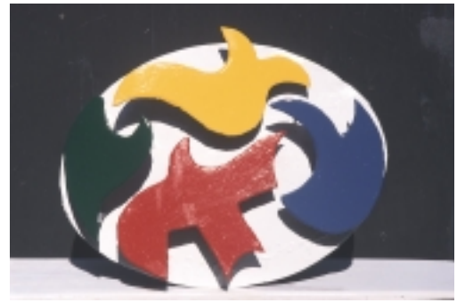
Hirondel, 2000, painted steel, 21" x 26" x 3"