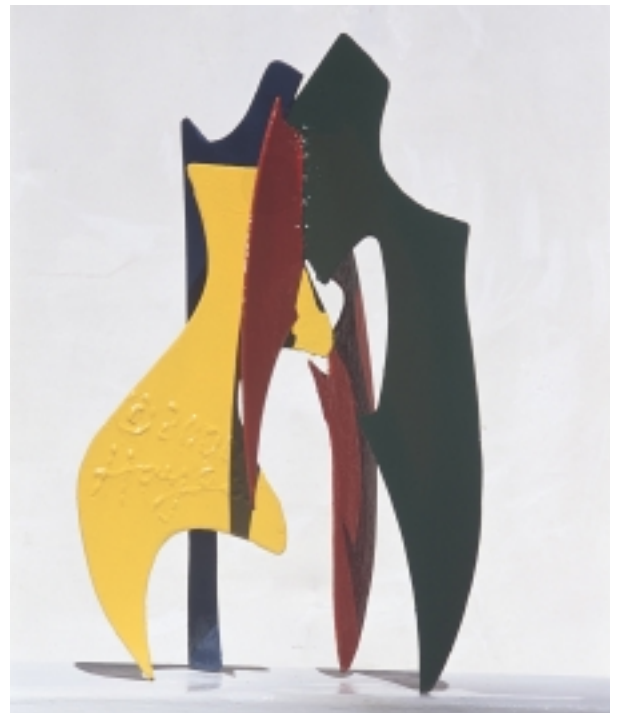
Quadraped, 2000, painted steel, 24" x 14.5" x 13.5"