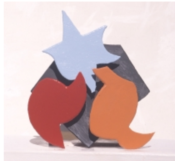
Sea Forms, 1998, painted steel, 16.5" x 16.5" x 2.5"