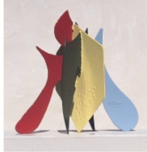
Sentinel, 1999, painted steel, 28" x 15" x 11"