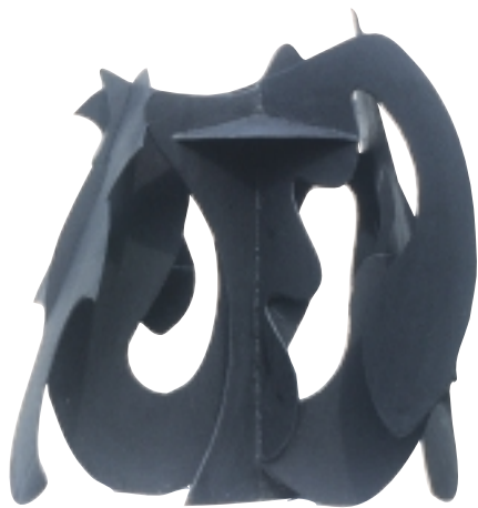
Landscape Sculpture, 2000, painted steel, 33" x 34" x 28"