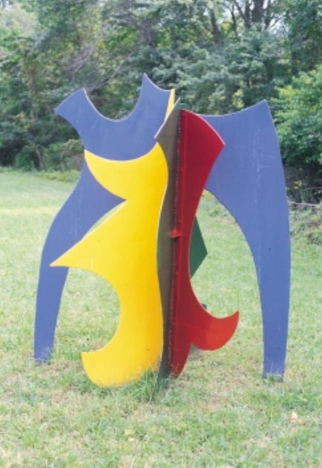
Arch, 1991, painted steel, 32" x 61" x 66"