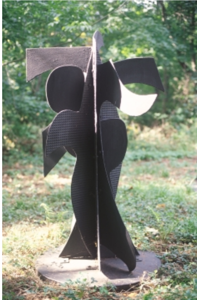
Horned Field Figure, 1992, painted steel, 73" x 42" x 44"