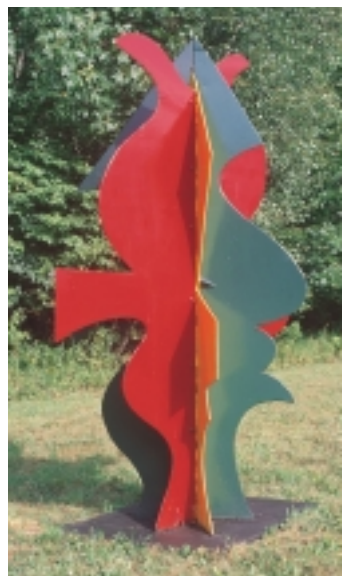
Katchina, 2000, painted steel, 103" x 66" x 50"