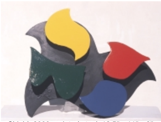
Shield, 2000, painted steel, 19.5" x 11" x 2"