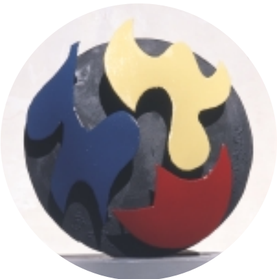
Trio, 2000, painted steel, 27" x 27" x 4.5"