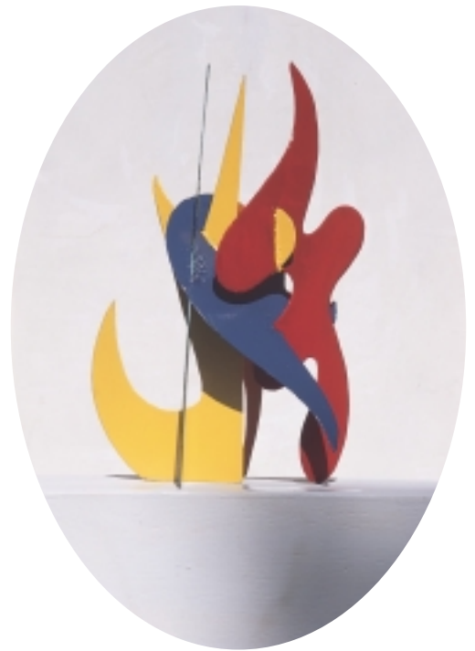
Knight Errant, 1999, painted steel, 29" x 19" x 15"