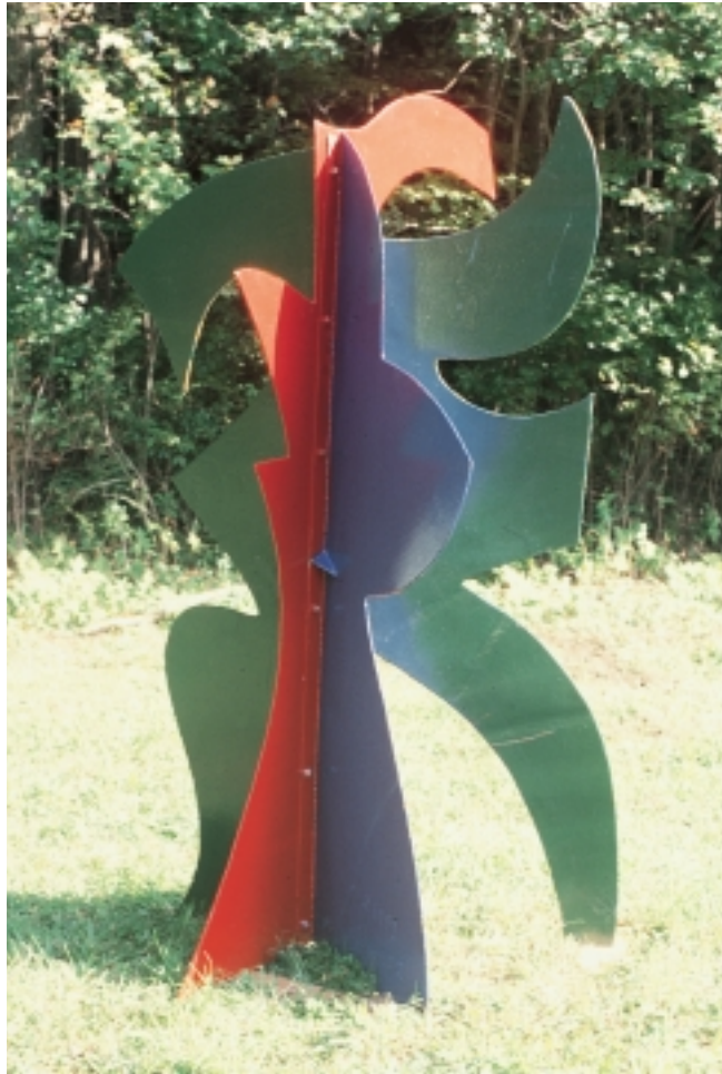
Caryatid, 1999, painted steel, 88.5" x 49" x 57"